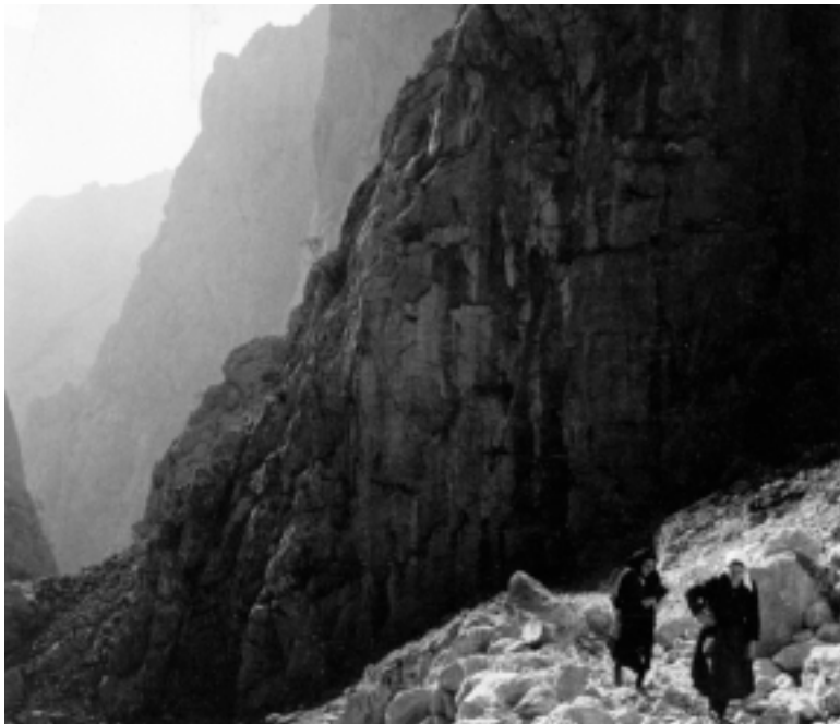
Vintage image of hearty hikers in beautiful mountainous Paklenica National Park in Croatia.

Newsletter of NAI's Resource Interpretation & Heritage Tourism (RIHT) Section